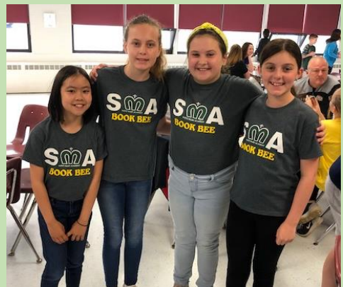
5 th Grade Book Bee Team. Thanks to these students for representing SMA!