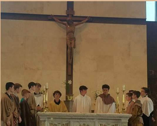
Holy Thursday Prayer Service led by our 8 th Grade Students