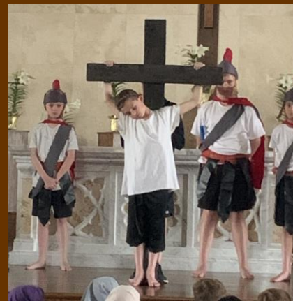
Stations of the Cross led by our 5 th Grade Students