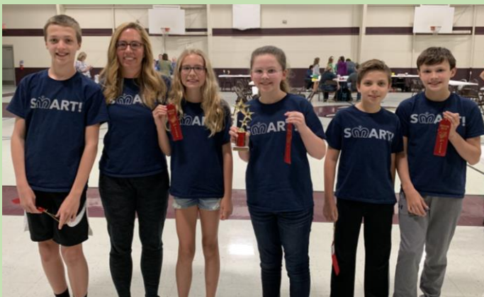
Congratulations to the 6 th Grade Book Bee Team. SMA placed 2 nd by 1 point. We are so proud of our students!