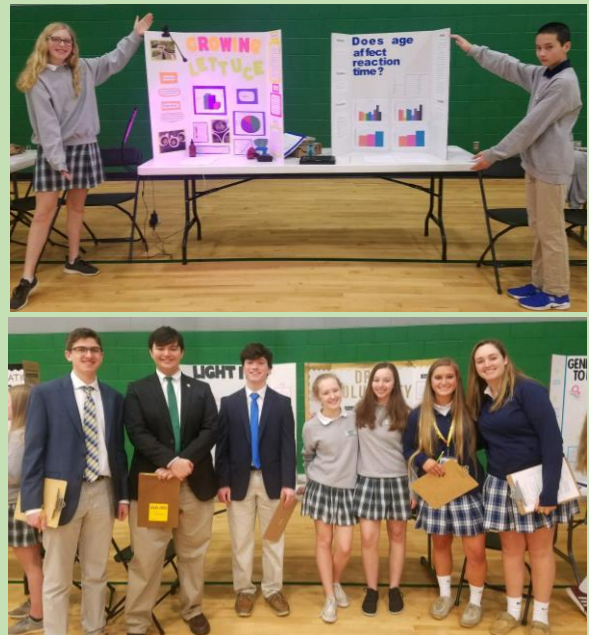
5 of the judges were our own SMA alumni

We now have but 3 of our 12 Basketball Teams remaining in the tournaments.... ALL THREE PLAY THIS WEEKEND.... 1 Team is playing for a TITLE and 2 in the Quarterfinals